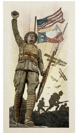
Texas Historical Commission

"The Yanks Are Coming: How Texans Helped Win the Great War" explores how World War I changed the world for the farmers, cowboys, tradesmen and small-town folk from around here.